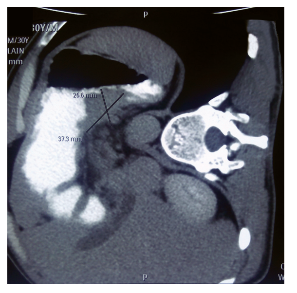
Figure 2: Computed tomography of the gastric wall.